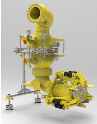
WITH DBV-ERC & HYDRAULIC QCDC