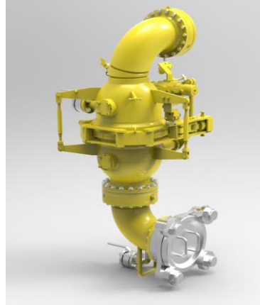
WITH DBV-ERC & MANUAL QCDC