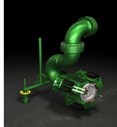
WITH HYDRAULIC QCDC ONLY

The Loadtec ERS and QCDC are built at our dedicated manufacturing facility and incorporate a number of features to ensure reliable and safe disconnection from the ship in the event of an emergency.